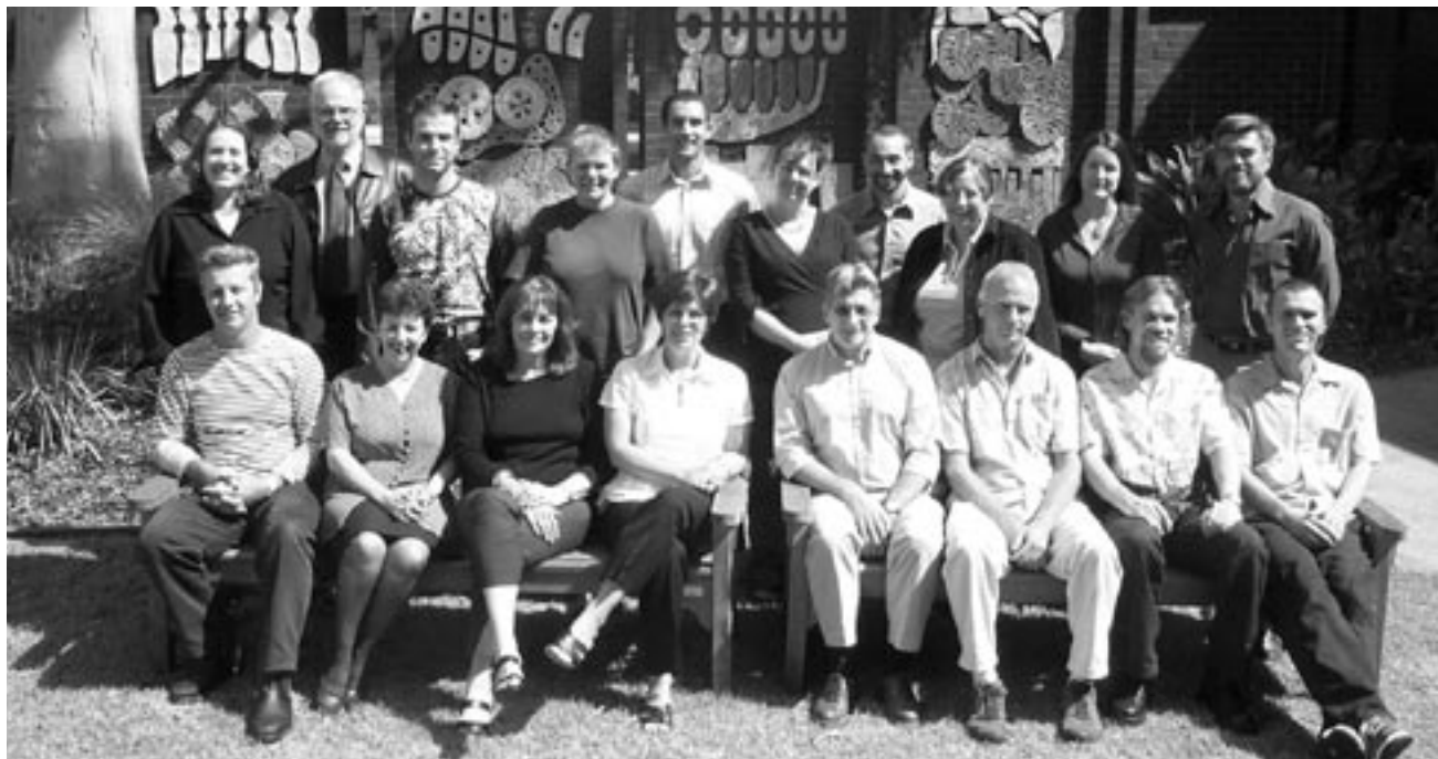
National Drug Research Institute staff