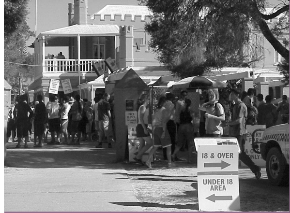
School leavers' celebrations on Rottnest Island

Findings from this formative research formed the basis of a comprehensive school leavers intervention in 2000. A range of agencies were involved in organising activities and a number of novel strategies were trialled. A report evaluating the implementation processes and impact of the intervention was produced by the community team.