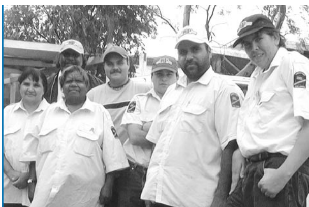
Tangentyere Night Patrol

The objective of this project is to research and develop a low-cost computerised database that will enable Aboriginal community controlled organisations to monitor and evaluate their night patrols and warden schemes. The project is being undertaken jointly by NDRI, Tangentyere Council, Julalikari Council, and Kununurra-Waringarri Aboriginal Corporation.